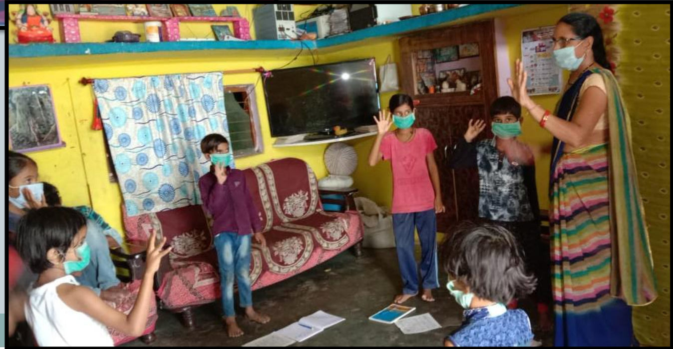
Sangakheda, Hoshangabad, MP Counting in rhythm & action