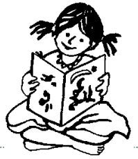
Bhaunra, dist Betul, MP Narrating lockdown tales