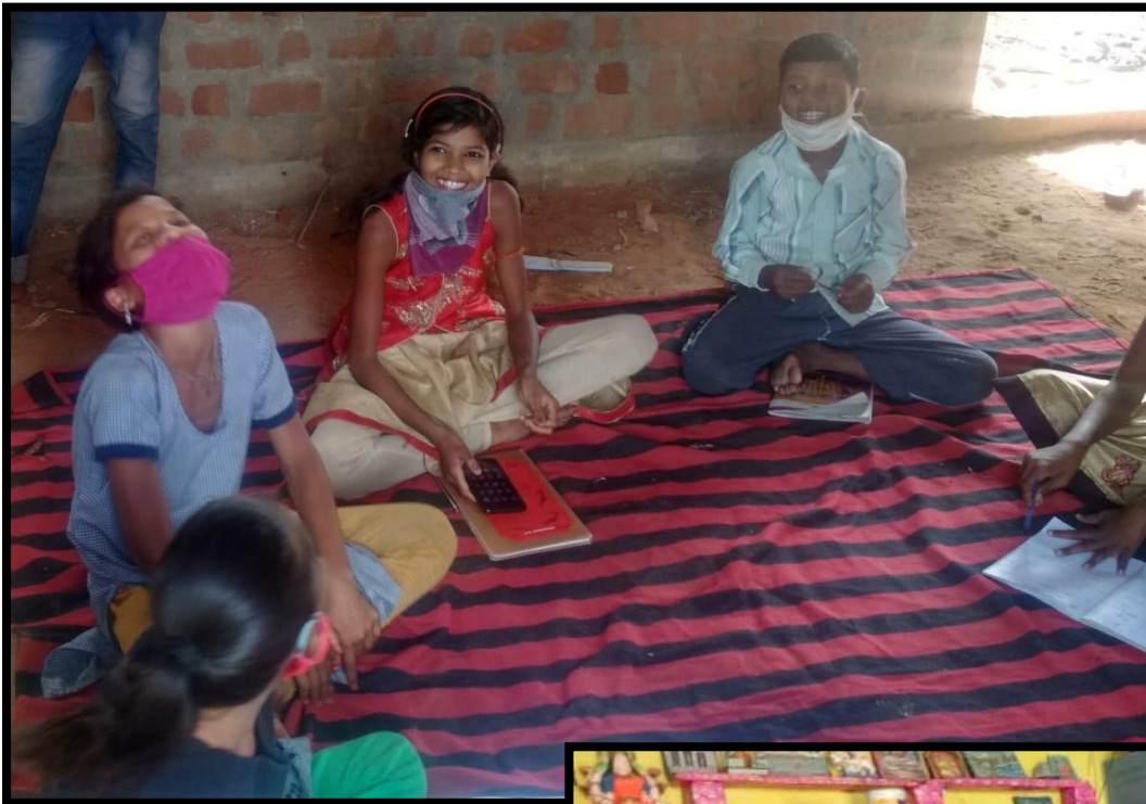
Kachhar, dist Betul, MP A story-telling session is joyful