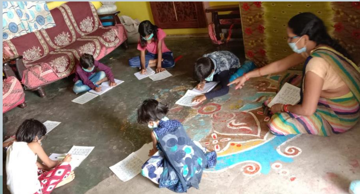
Bhanpur, Hoshangabad, MP Reading and writing