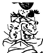
Illustration & Layout MONIL DALAL